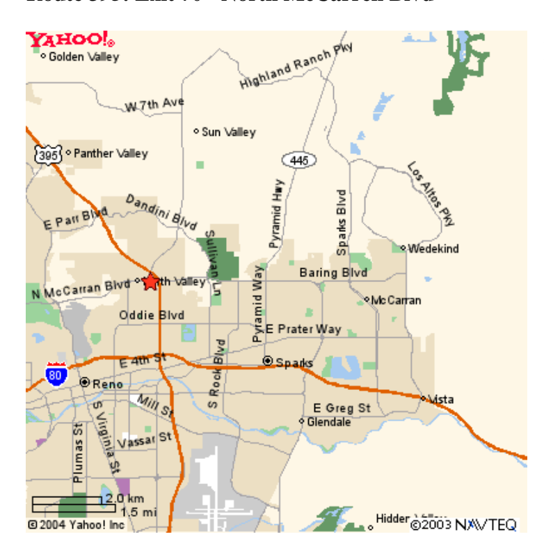
Route 395: Exit 70 - North McCarren Blvd

(Highway Exit for Home Depot, Walmart and Winco )